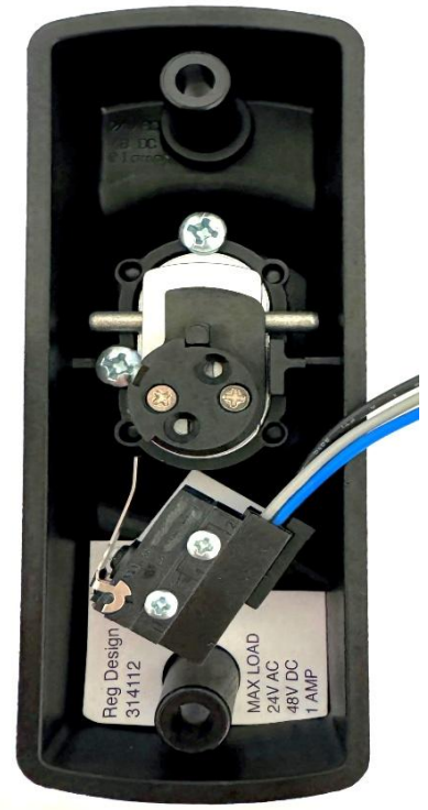
Install Cams which are included to change function to Key Removable OFF or ON Do not over tighten Cam Screws