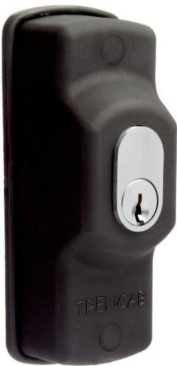
Rubber Gasket, Screw Cover Caps

Ideal override keyswitch for Gates, Doors, Boom Gates, etc.